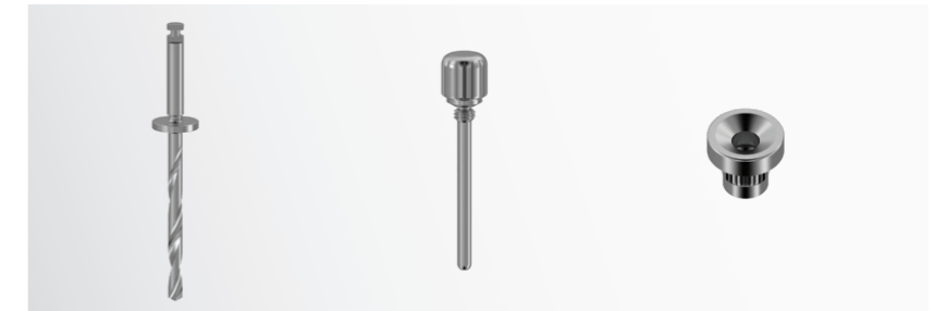
Drill pin with bit