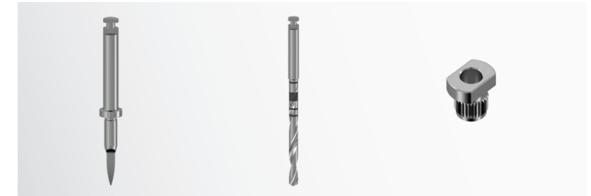
Pointer drill with bit