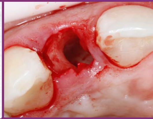
Extraction site - mesially oriented