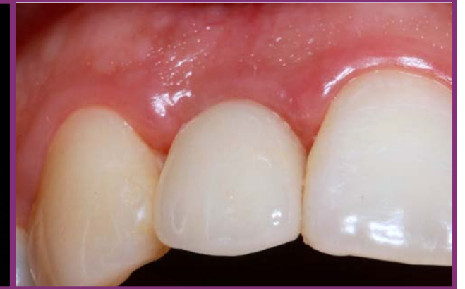
Final restoration in place Close-up