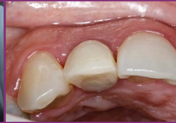
Provisional restoration occlusal view 4 months after surgery