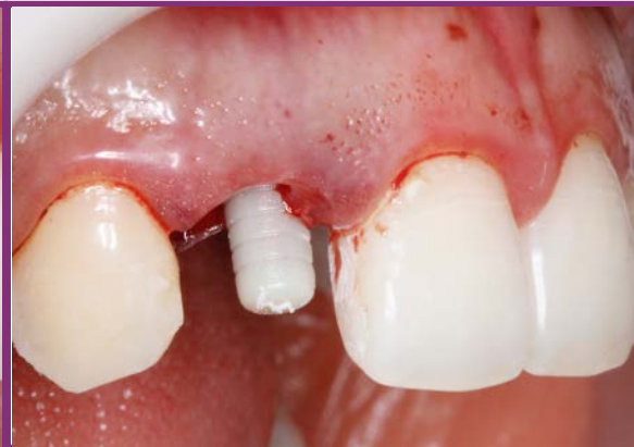
Universal Abutment provisional coping in place