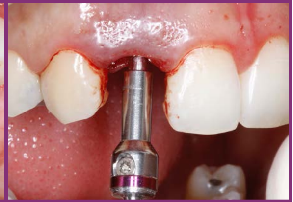
Implant bed preparation - drill extension