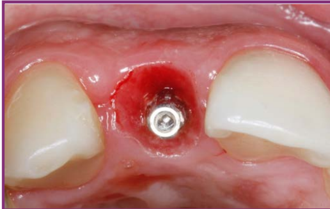
Great emergence profile 4 months after surgery