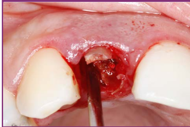
Minimally traumatic extraction with periosteal