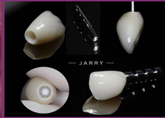
Porcelain applied to Zirconia coping