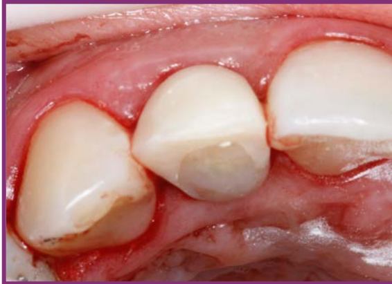
Provisional restoration in place - occlusal view