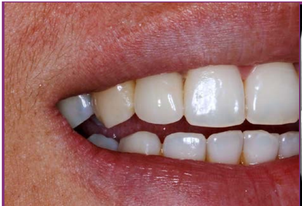
Final restoration Extra-oral lateral view