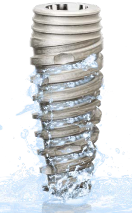
CM Drive Acqua