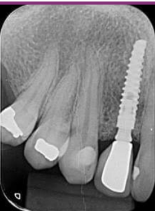
2-year follow-up X-ray