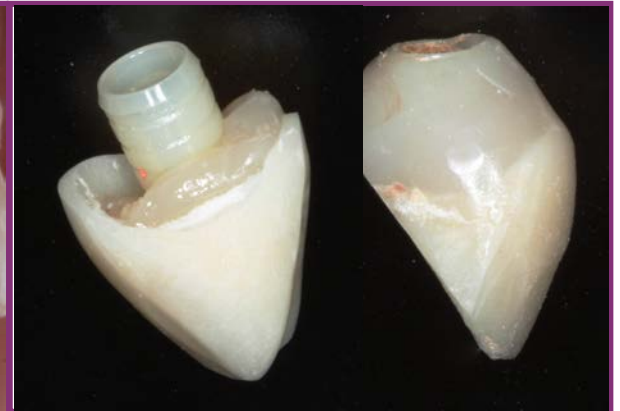
Provisional universal abutment coping captured into prefabricated crown shell