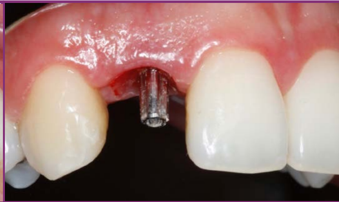
Stable soft-tissue contour 4 months after surgery