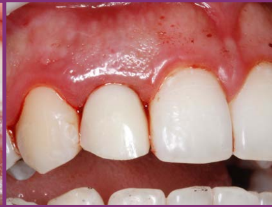
Provisional restoration in place - labial view