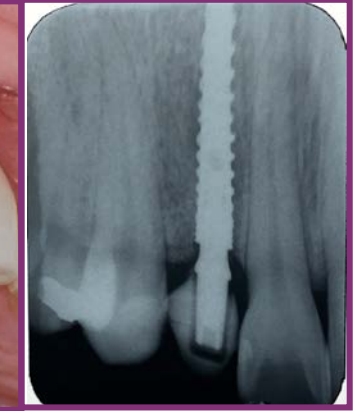
3 month post provisional restoration X-ray