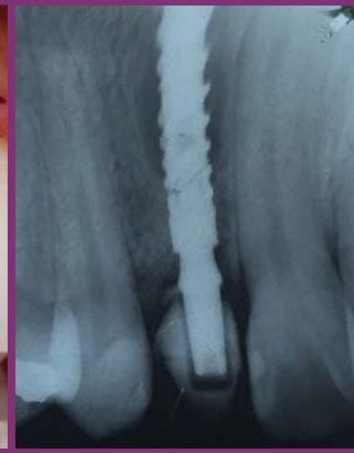
Immediate post op. x-ray