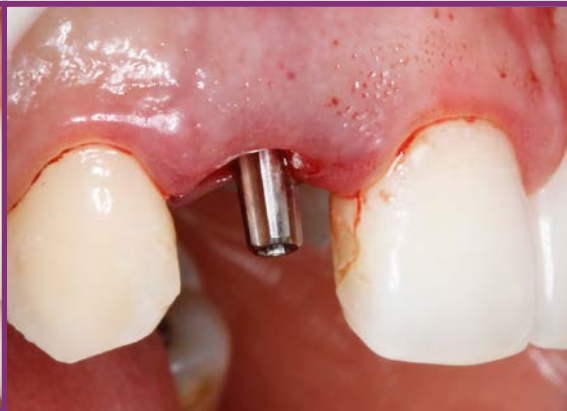
Abutment in place