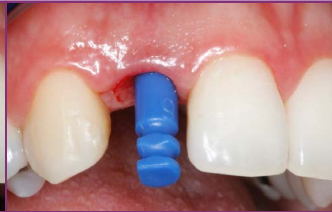
Universal abutment impression coping in place