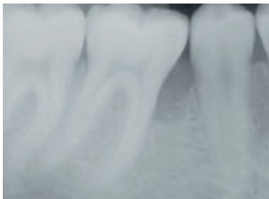
Post op