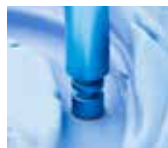
2. Insert model analogue