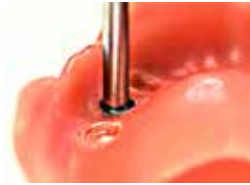
2. Insert into matrix housing briefly to transfer heat