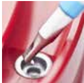
1. Use the side with stainless steel finish