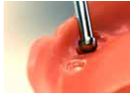
3. Apply leverage to remove matrix housing