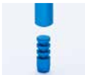
1. Mount model analogue