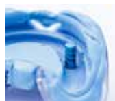
3. Simple handling