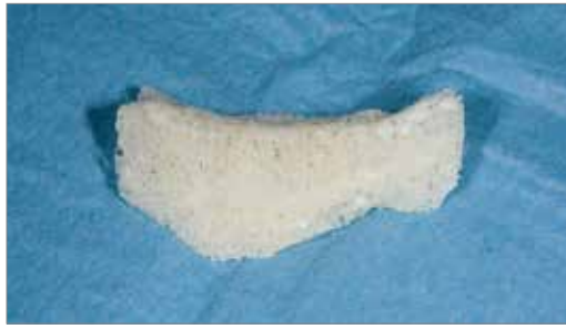
Custom designed and milled AlloGraft Custom Block