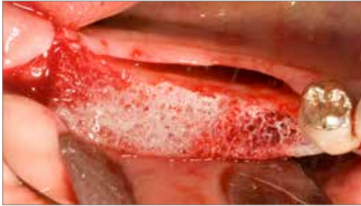
AlloGraft Custom Block in situ