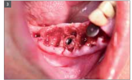
3 Placement of the implant in order to fix the ring with the implant into the residual bone