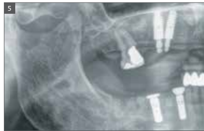
5 6 month post-op