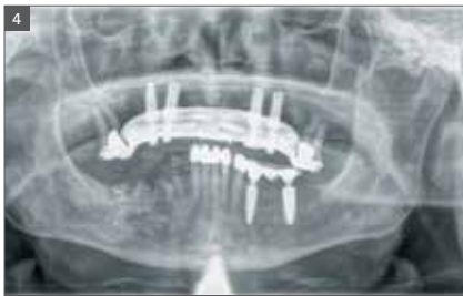
4 Pre-op x-ray