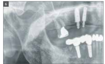
6 1 year after loading