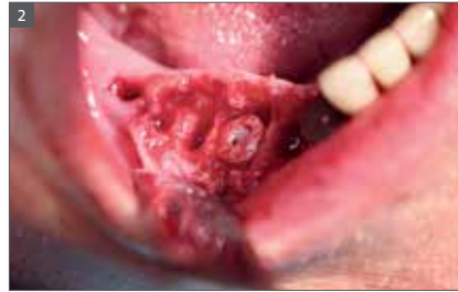
2 Integration of the Straumann AlloGraft Ring into an extraction socket after ring bed preparation