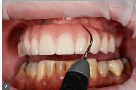
2 Lavage-Before debridement.