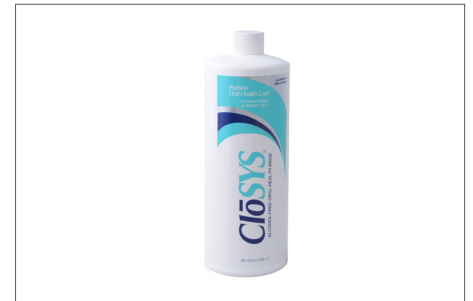
Non-alcohol antimicrobial mouth rinse twice daily.