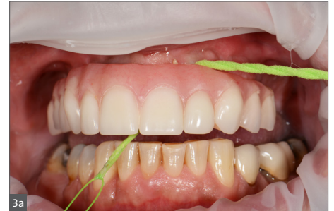
3a Assess the area for calculus.