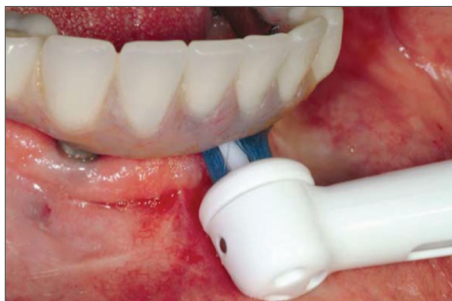
Brush twice daily to remove bacterial plaque with a low-abrasive dentifrice.