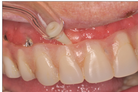
Floss twice daily or use Water irrigatore twice daily, (Pikpocket™ Tip).