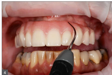
4 Lavage-After debridement.