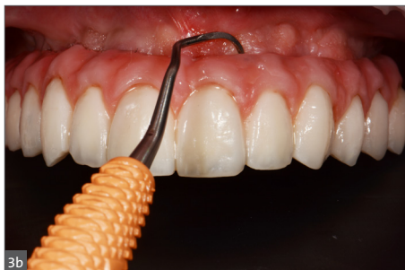
3b Debridement Wingrove L3-4 PDT, Inc.