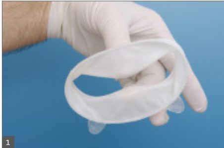
1 OptraGate® retractor fold and insert between the lips and vestibule courtesy of Ivoclar Vivadent.