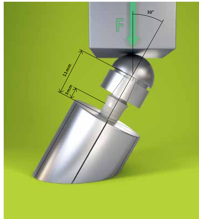
Fig. 1: Test setup according to ISO 14801

The Straumann® PURE Ceramic Implant System has undergone rigorous mechanical tests (ISO 14801 3 standard) in order to identify the ultimate fracture resistance and fatigue strength. According to the ISO norm 14801, the implant-abutment system (1) is fixed in a block with the coronal aspect of the system exposed (2) in order to simulate a bone recession of 3 mm. A second block applies a cyclic load (3) acting with a specific force (F) defined by the test requirements of the implant-abutment system. The implant is positioned with an inclination of 30° towards the force axis with a distance of 11 mm to the embedded plane. This strength test is crucial in determining the long term mechanical reliability of the completed implant treatment and restoration.