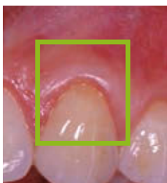
8 months after treatment with Straumann® Emdogain® Root completely covered