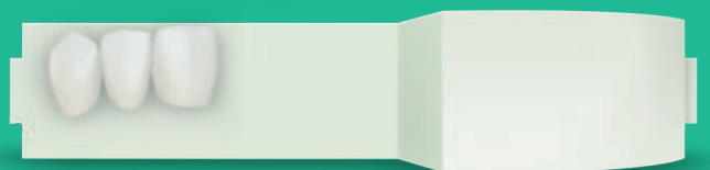
Monochromatic discs available in various shades.

Save time with improved efficiency and high predictability.