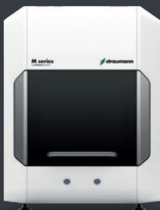
M series/Motion 2

The M series/Motion 2 is a universal, cost-efficient production system that can handle the majority of cases. With multiple workflow options, you can enjoy the full flexibility of using one system regardless of what challenges arise. And for work peaks or complex cases, our centralized milling facility operates as an extension to your lab.