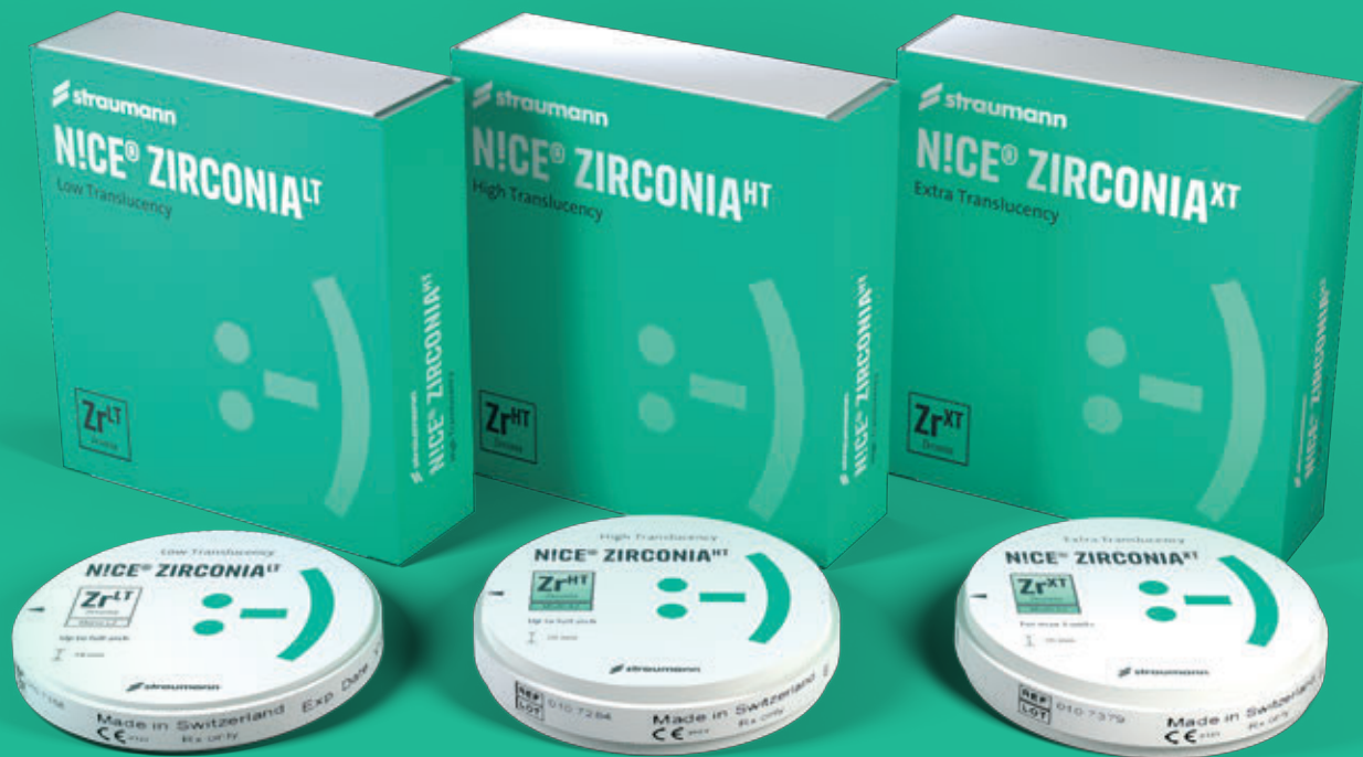
nIce® Zirconia discs