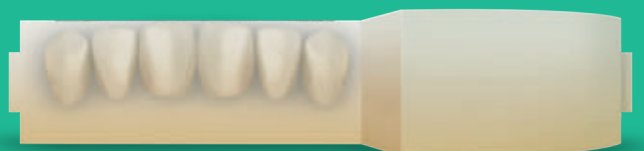
Multi-layered discs for esthetic restorations.