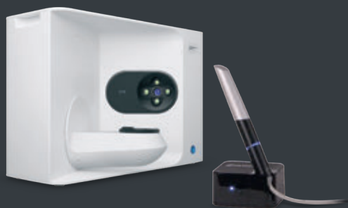
Virtuo Vivo™, 3Shape TRIOS®, Medit scanners

Discover our broad spectrum of intraoral and lab scanners. Choose the digital solution that best fits your needs from plug&play simplicity to empowering innovation that redefines the boundaries of possibility. The perfect starting point in your digital workflow. Our innovative scanning technology empowers you to scan and transmit accurate, digital impressions seamlessly.