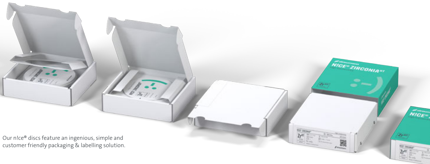
Our n!ce® discs feature an ingenious, simple and customer friendly packaging & labelling solution.

Furthermore, we use minimal packaging for storage optimization. All our packaging uses recycled, and environmentally friendly FSC* carton instead of traditional foam in line with our sustainability goals.